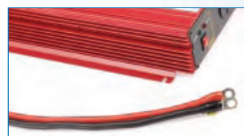
Battery lugs with 110cm lead

“The IM2000 inverter combines all the features you need to power appliances that make caravanning more enjoyable such as microwaves, toasters, bar fridges and televisions.”