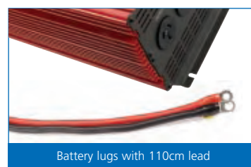
Battery lugs with 110cm lead

“Packs plenty of power for running multiple large appliances. Ideal for long trips or work sites where power demand is high and constant.”