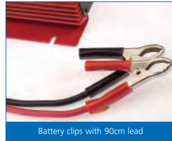
Battery clips with 90cm lead

“ The versatile IM600 inverter is for those more serious about remote power. It can be permanently mounted inside a vehicle and features twin power outlets to safely run multiple appliances. ”